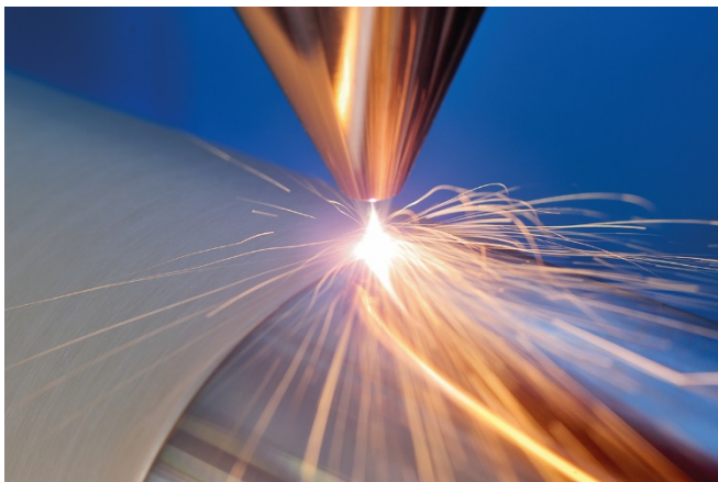
Image 1: Keeping the process under control: Fraunhofer ILT has developed an inline measuring system for sophisticated additive laser processes, such as the Extreme High-Speed Laser Metal Deposition EHLA.

Interested parties can find out more details from April 24 to 27, 2018 in Stuttgart at CONTROL 2018 at the joint booth of the Fraunhofer Alliance VISION 6302 in Hall 6. Fraunhofer ILT will be presenting a camera module with integrated lighting mounted on a typical working head. The Aachen engineers will demonstrate how the laser module functions on the computer.